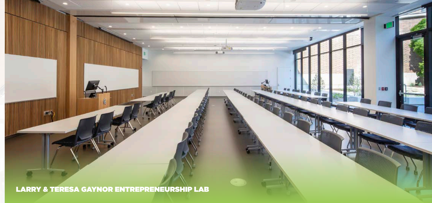
LARRY & TERESA GAYNOR ENTREPRENEURSHIP LAB