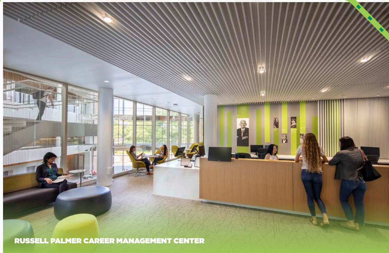
RUSSELL PALMER CAREER MANAGEMENT CENTER