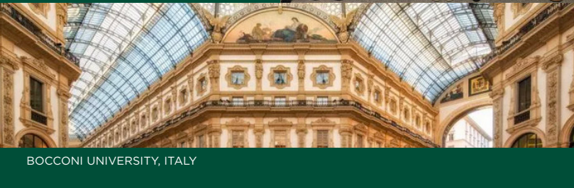
BOCCONI UNIVERSITY, ITALY