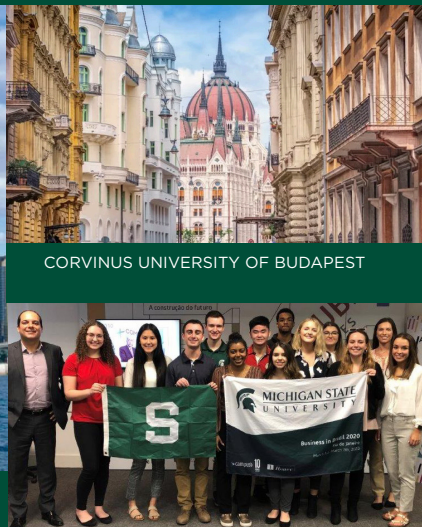
CORVINUS UNIVERSITY OF BUDAPEST