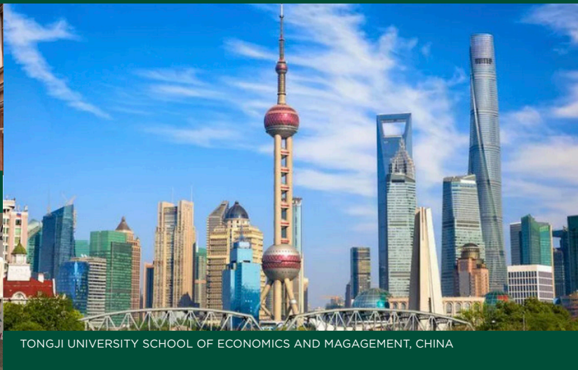
TONGJI UNIVERSITY SCHOOL OF ECONOMICS AND MANAGEMENT, CHINA