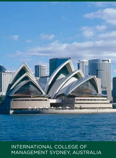
INTERNATIONAL COLLEGE OF MANAGEMENT SYDNEY, AUSTRALIA