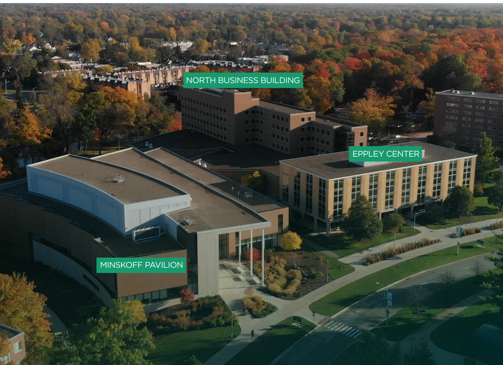
NORTH BUSINESS BUILDING

Eppley Center | North Business Building | Minskoﬀ Pavilion | Law College Building | McDonel Hall