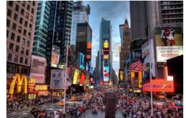
New York (New York City)