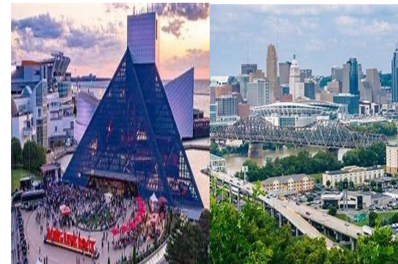
Ohio (Cleveland, Columbus, Cincinnati)