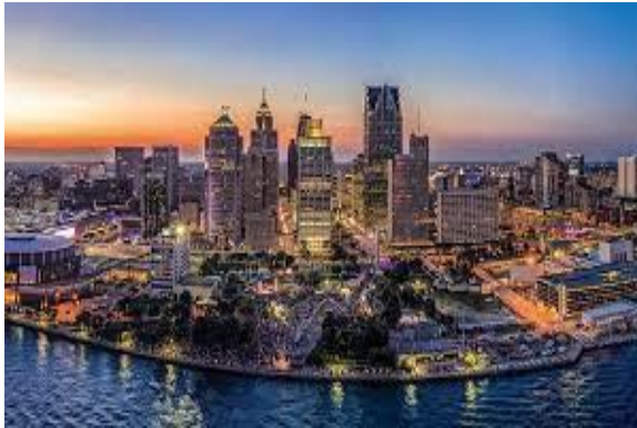
Michigan (Detroit, Lansing, Grand Rapids)