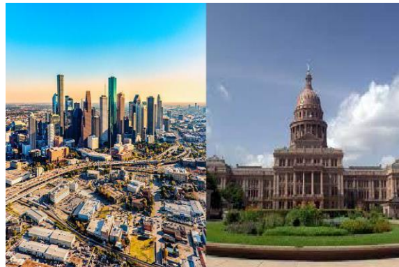
Texas (Houston, Austin, Dallas)